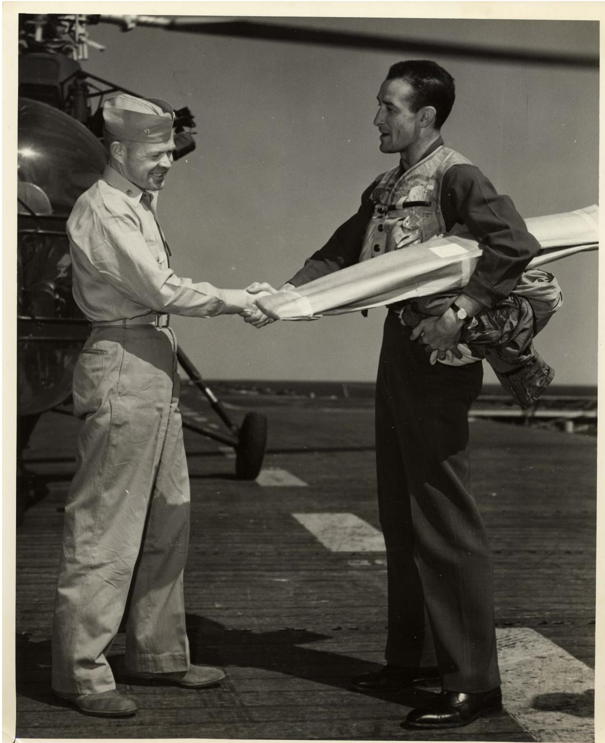
1953 After being rescued in Wontan Bay where he was shot down during the Korean War.

Halito: This email originated from outside of the organization. Do not click links or open attachments unless you recognize the sender and know the content is safe.